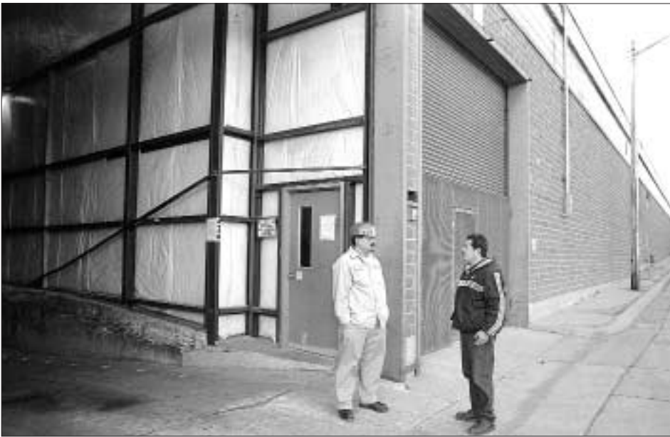
Migrant farmworkers were initially recruited to work in Minnesota's sugar beet industry during the early part of the twentieth century. Today, farmworkers in south-central Minnesota work in farm fields, processing plants, and nurseries, and help to grow and process a wide range of meat and vegetables. Here workers at a processing plant in Owatonna wait for a truck to arrive at the loading dock.

One-fourth of the migrant farmworkers who participated in the survey reported experiencing social discrimination, racism, or isolation while living in southern Minnesota. Some of the families felt discriminated against by landlords when looking for a place to live. Others reported feeling uncomfortable walking down the streets of rural cities because of negative reactions from some year-round community members.